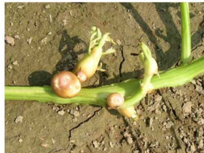
Aerial tubers may form on the stems.