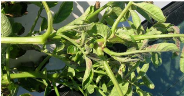
Nodes swell and turn purplish, and axial buds elongate.