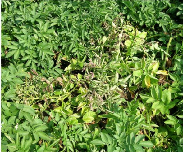
Leaves of infected plants turn purple and curl. Infected plants may die early.