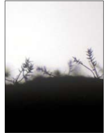
Figure 6.—Closeup view of silver scurf on tuber. Note the production of conidiophores with conidia (spores).

After tubers have been stored at high humidity, margins of young lesions may have a sooty appearance due to the presence of fungal spores. Close evaluation with a hand lens or microscope may reveal structures with a Christmas tree shape, which are spore-producing conidiophores (Figure 6). The “branches” are spores. If the spores have dislodged, the conidiophores look like short, black strings.