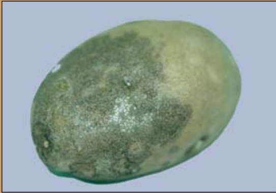
Figure 1.—Silver scurf infection originating from the field.