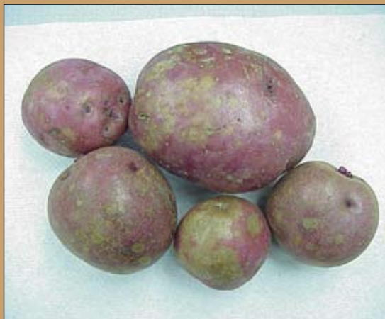
Figure 2.—Silver scurf on red potatoes.