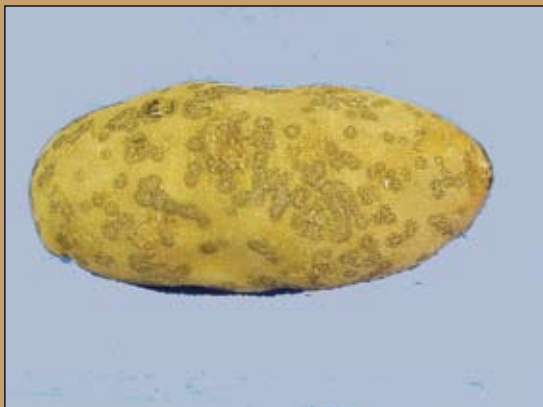
Figure 3.—Silver scurf on Russet Burbank following secondary spread in storage.