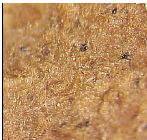
Figure 4.—Closeup view of black dot on tuber. There are no conidiophores (contrast with Figure 6).

Identification of these two diseases requires examination with a hand lens or microscope to distinguish between the characteristic black sclerotia of black dot and the conidia and conidiophores of silver scurf. Both fungi can infect the same tuber (Figure 5).