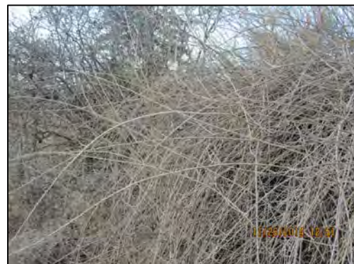
Figure 2. Matrimony vine near Gap Road Prosser, WA during November 2014

Since then we sampled matrimony vine stands regularly to determine the importance of this plant as a host of potato psyllids. Seven locations of matrimony vine stands were identified in Washington State (Prosser – two locations, Selah, Kahlotus, Overturf, Pullman, and George), and one location in Idaho (Eagle) which were sampled on a regular basis using beat trays and D-Vac sampling methods. We collected potato psyllids from all locations except George, WA in spite