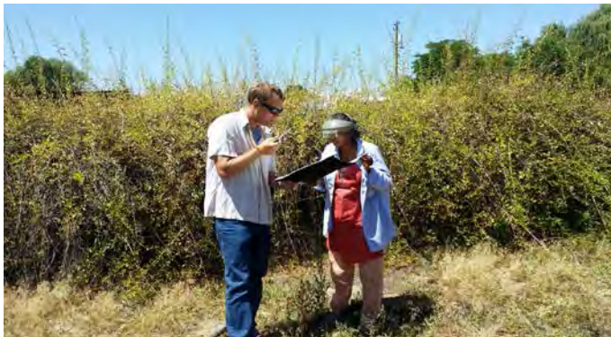
Figure 1. Matrimony vine near Gap Road, Prosser, WA during August 2014

Matrimony vine ( Lycium spp.) is reported as a potential breeding host for migrating B. cockerelli populations in Southwestern US (Romney 1939), but the presence of these plants in the PNW has been overlooked by ZC researchers. B. cockerelli adults were first collected from matrimony vine near Selah, WA in June of 2014.