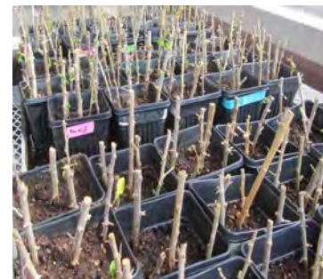
Figure 3. Soft wood cuttings of matrimony vine sprouting in greenhouse

Matrimony vine is a shrub with elongated wire-like stems and tiny purple flowers produced throughout the summer months. During winter the plant loses all its leaves and appears as a dry bush, which then rejuvenates each year in early spring. The plant is thought to have initially arrived in the region with early settlers. Wolfberry and matrimony vine are also known as Goji berry, which is grown commercially and in back-yard gardens for its fruit. The berries are sweet, dark red colored fruit, which are known for their health properties in Chinese medicine (John Trumbo, Tri-city Herald, October 18, 2004). The plants are commonly seen in patches along fence lines. These patches increase in size by growth and spread of underground stolons. Soft wood cuttings can be used to propagate the vine (Figure 3).