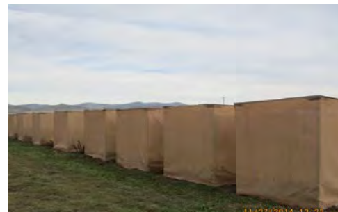
Figure 5. Matrimony vine planted in field cages at Moxee farm, WA