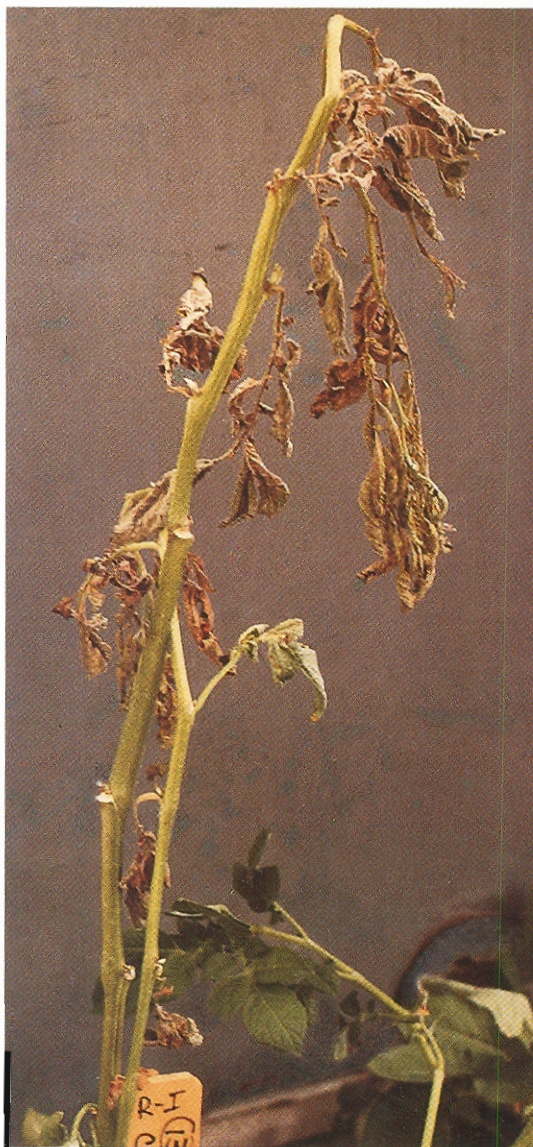
Fig. 1. Symptoms of severe Verticillium wilt on Russet Burbank potato.

Potato seed also may provide a source of inoculum, but its importance is questionable. Recent unpublished studies by the University of Idaho demonstrate that even when Verticillium -free seed is introduced to virgin ground, V. dahliae infection in potato stems commonly appears by season's end. This may be explained by the ability of soilborne V. dahliae microsclerotia to survive air drying as it moves from field to field with high winds.